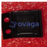
ADV7391WBCPZ Analog Devices, Inc LFSCP-3