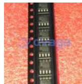
AD8170AR Analog Devices, Inc SOP8