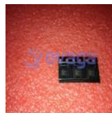
ADV7390BCPZ Analog Devices, Inc QFN32