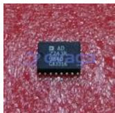
ADV724JR Analog Devices, Inc SOIC-16