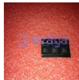
ADV7390BCPZ Analog Devices, Inc QFN32