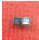
ADV7393BCPZ Analog Devices, Inc LFCSP-VQ-40