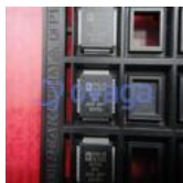
ADV7341BSTZ Analog Devices, Inc LQFP-64