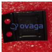
ADV7391WBCPZ Analog Devices, Inc LFSCP-3