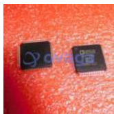
ADV7181CBSTZ Analog Devices, Inc LQFP-64