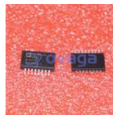
ADUM4160BRIZ Analog Devices, Inc SOIC-16