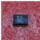
AD724JR Analog Devices, Inc SOIC-16