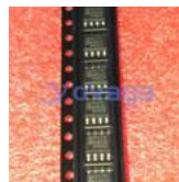
AD8170AR Analog Devices, Inc SOP8