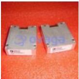
ADIS16488BMLZ Analog Devices, Inc MSM24