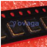
ADXL103CE Analog Devices, Inc CLCC-8