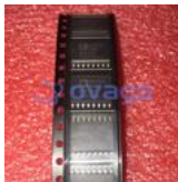
AD7401YRWZ Analog Devices, Inc SOIC-16