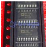
AD7192BRUZ-REEL Analog Devices, Inc TSSOP-24