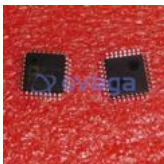
AD7938BSUZ Analog Devices, Inc TQFP-32