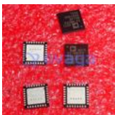
AD7124-8BCPZ-RL7 Analog Devices, Inc LFCSP-32