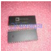
AD574AJNZ Analog Devices, Inc PDIP-28