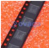
ADAS3022BCPZ Analog Devices, Inc LFCSP-40