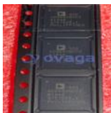
AD9680BCPZ-500 Analog Devices, Inc LFCSP-64